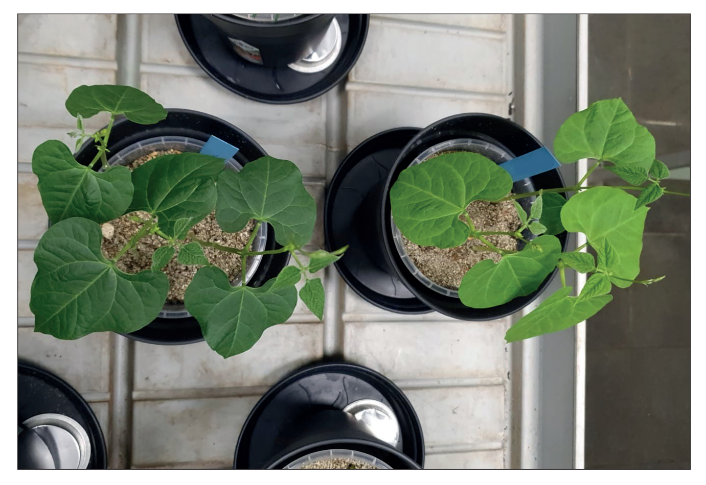
Left: Common bean inoculated with RhizoFix® with clear green color / Right: Common bean without inoculation