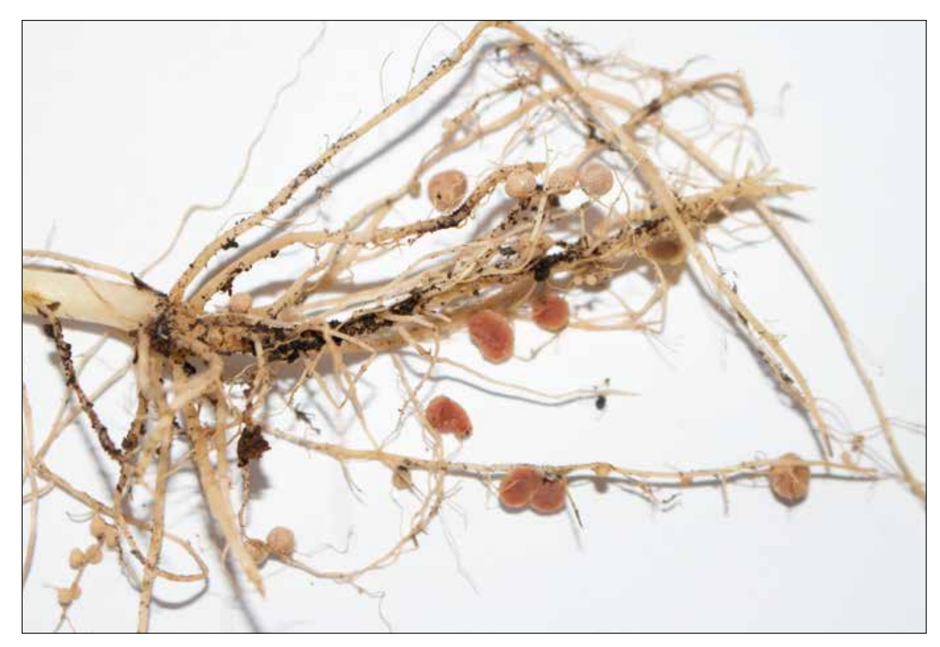
Nodules of a broad bean plant inoculated with RhizoFix®